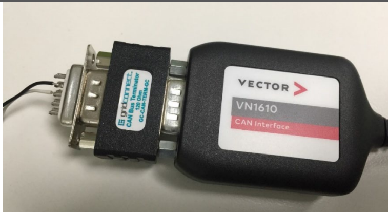
Figure 2: Sample Setup