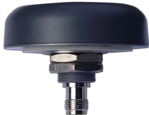
TW3400 Dimensions (mm)

Flat radome is shown, Conical Radome also available